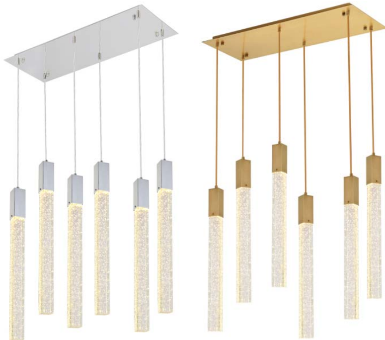
Chrome Item No: 2066D32C